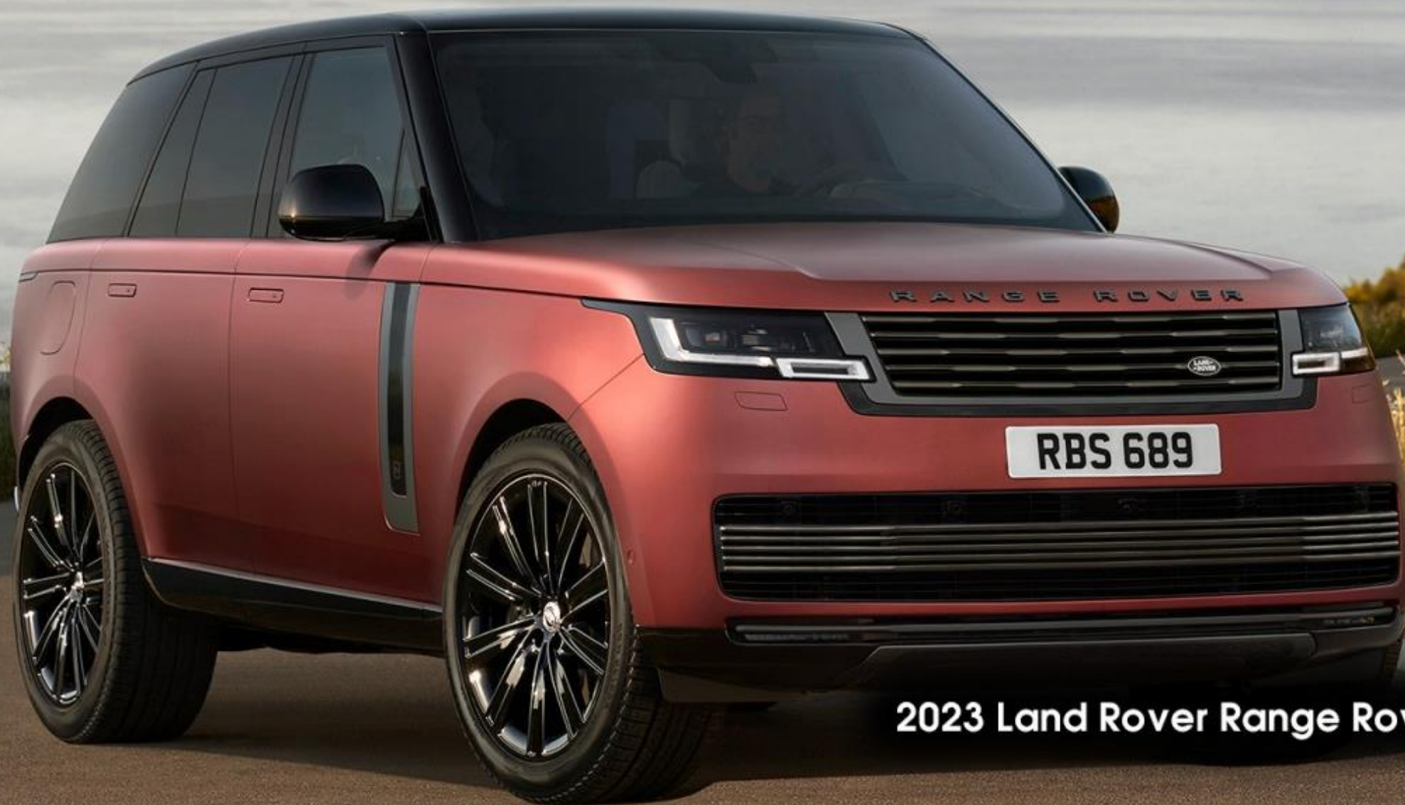
2023 Land Rover Range Rover shown