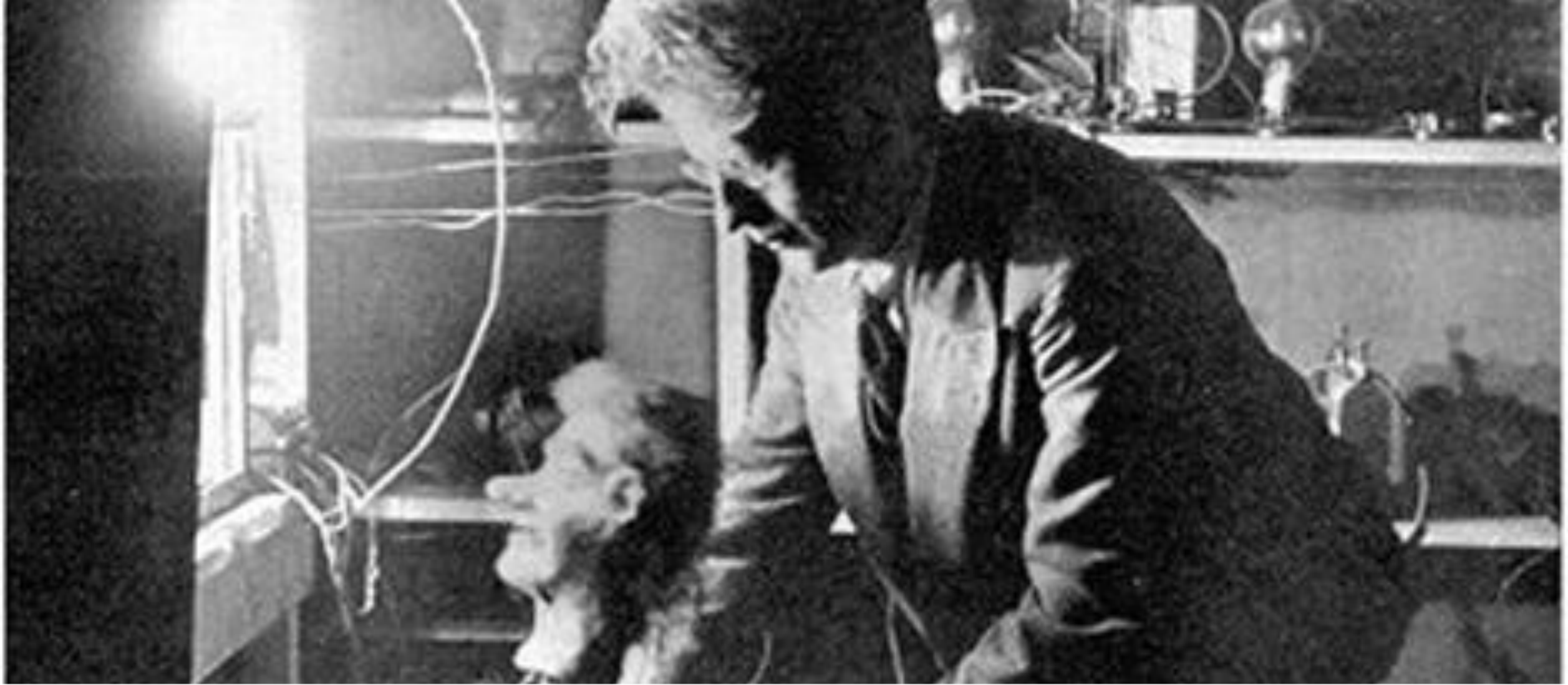
John Logi Baird with Stookie Bill